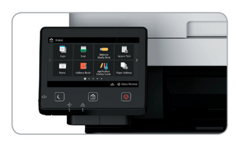
* Printer Screen May Vary.