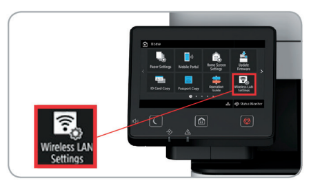
* Printer Screen May Vary.