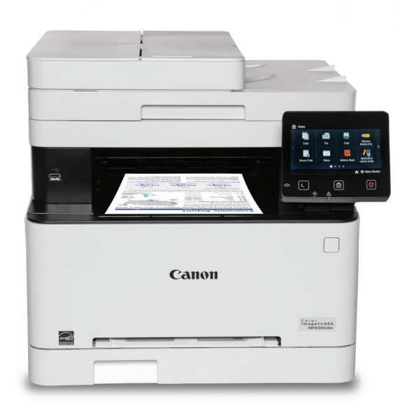
Colour imageCLASS MF656Cdw